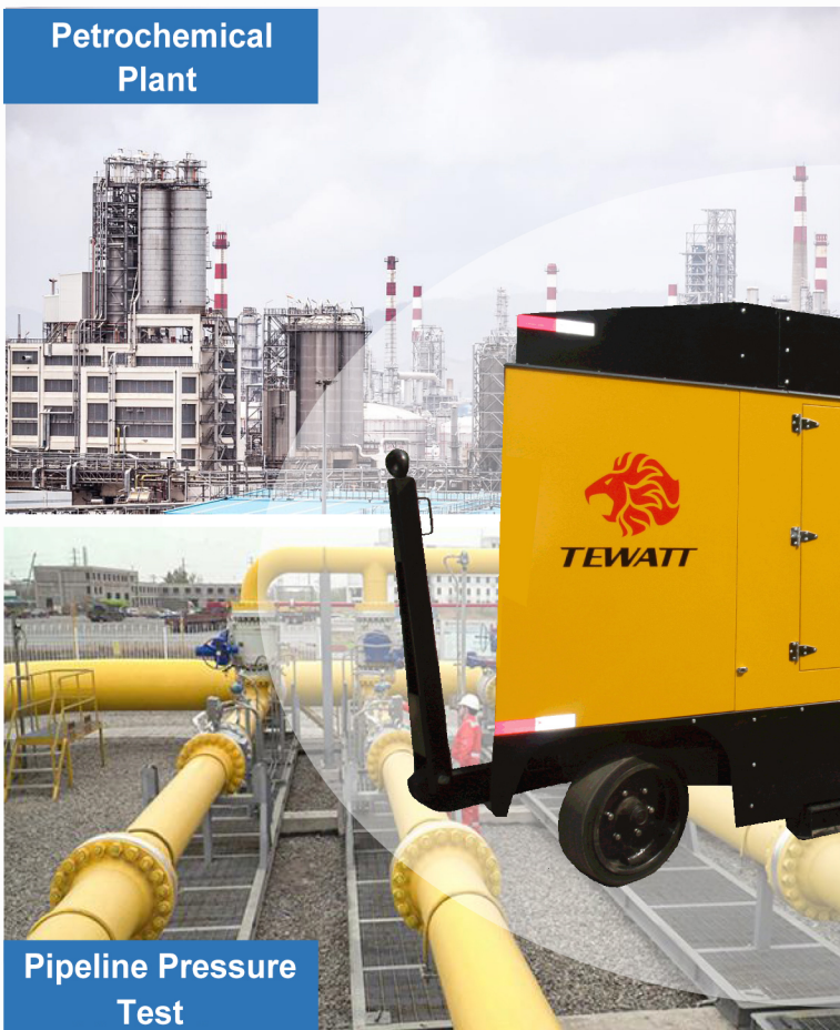
Pipeline Pressure Test